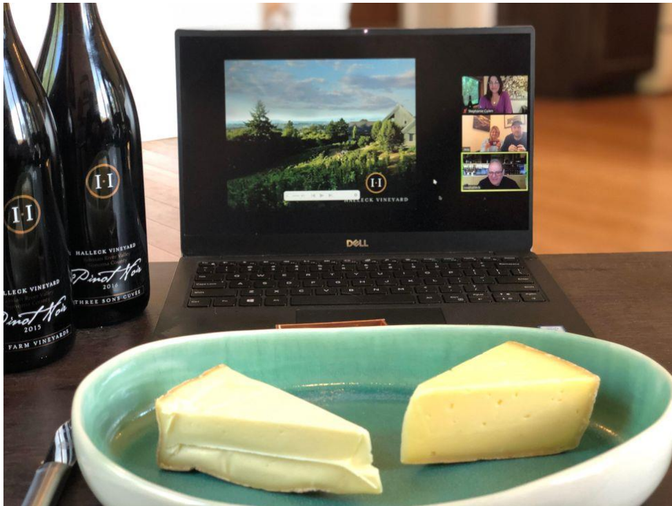
Halleck Vineyards sent cheese and truffles to pair with their wines. (Jess Lander)