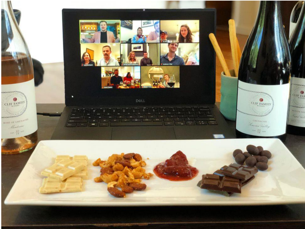
A group tasting with Clif Family Winery came with food pairings and recipes.

This is essentially what I described above, but with all of your closest friends. By far the best use, IMO, for these virtual tastings is to shake up your daily Zoom sessions with friends and family by inviting them all to join you on a wine tasting adventure. Simply find a time that works for everyone (we all have pretty open schedules these days, right?) and then each participant will order their own wine shipment.