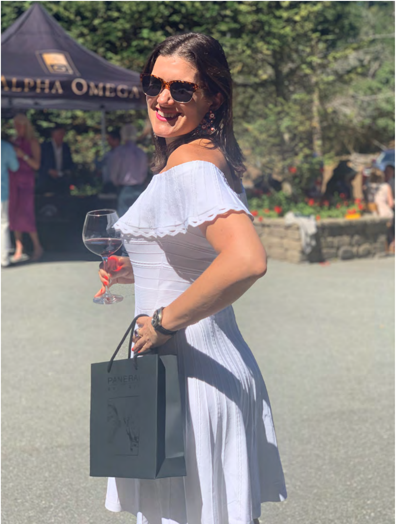
All smiles modeling the PANERAI watch!