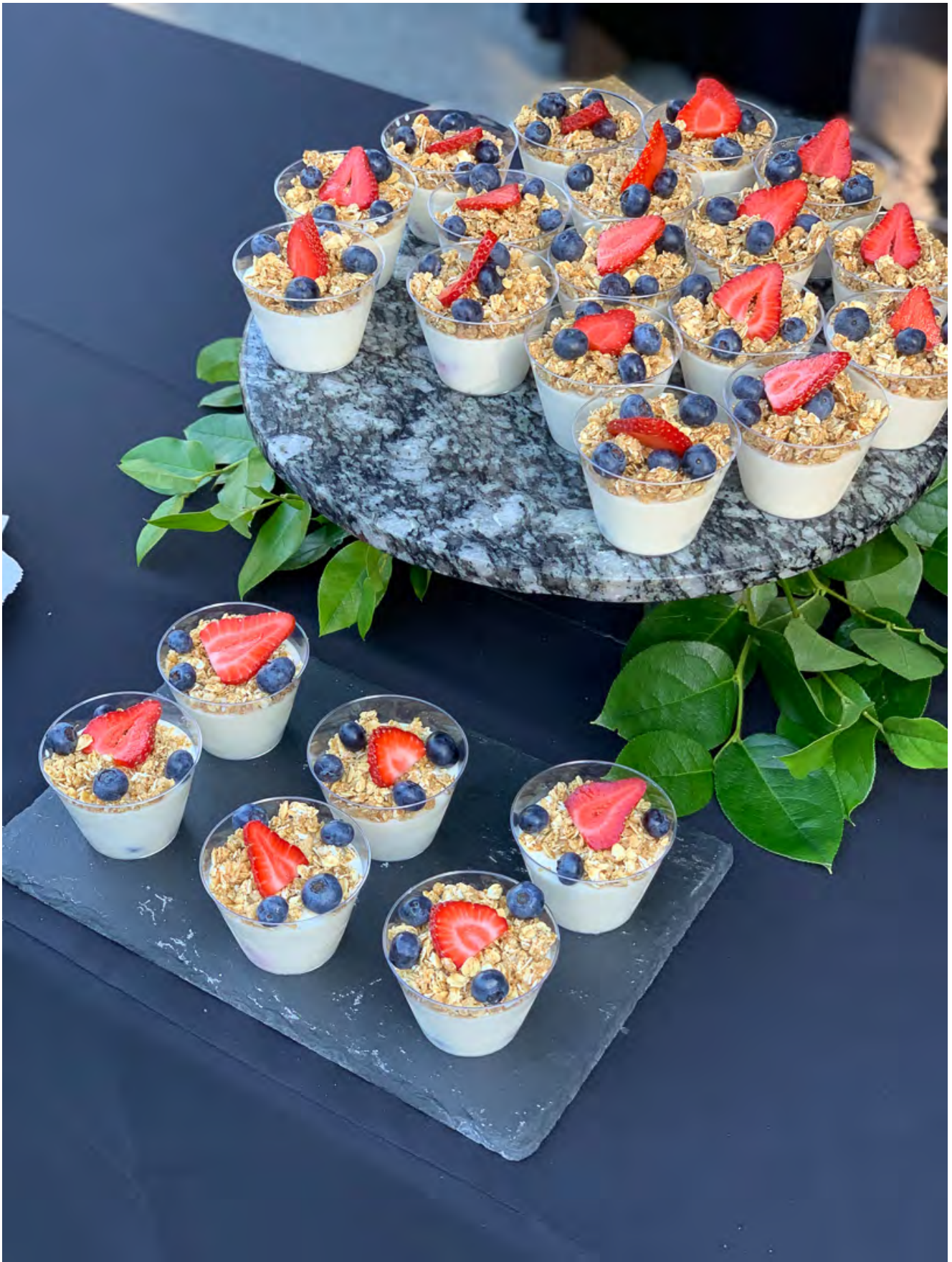
Guests enjoyed an extensive breakfast spread (in addition to the Caviar) during this event. The Alpha Omega team and Tolosa really do throw a fabulous party. Endless wine, delicious food, and beautiful cars!