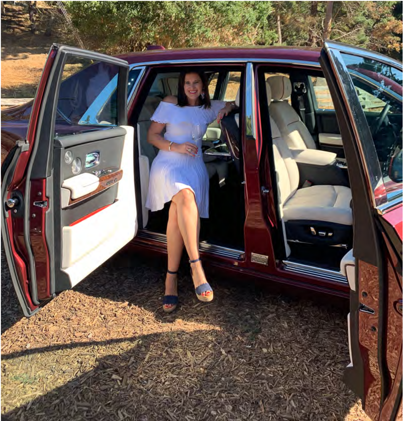
All smiles exploring the beautiful brand new Rolls-Royce at the event. I could get used to this every day!