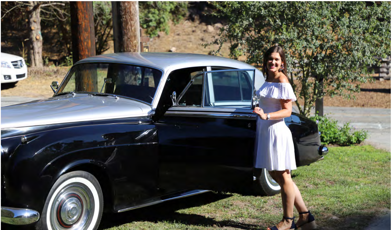
After the champagne welcome, guests were guided out front to watch the Concours d'elegance car show driving by and enjoy the stunning Rolls-Royce automobiles which joined for the event.