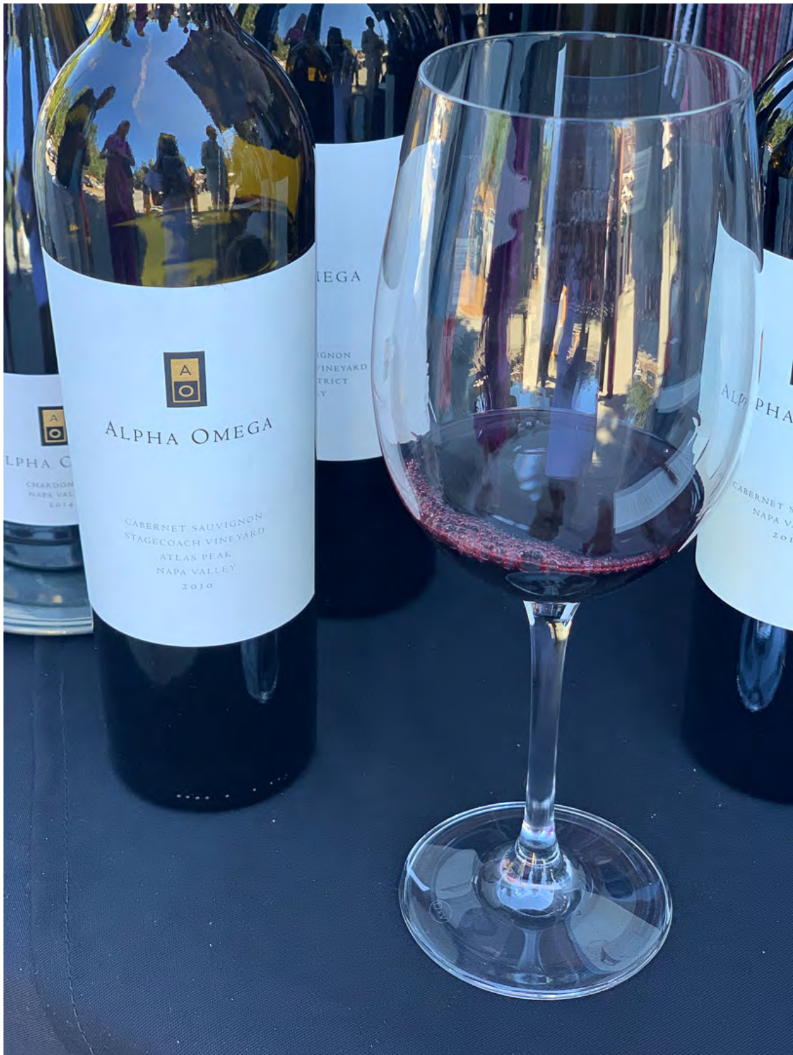
Cheers to enjoying the beautiful Alpha Omega Wines throughout this event after breakfast of champions, Champagne and Caviar.