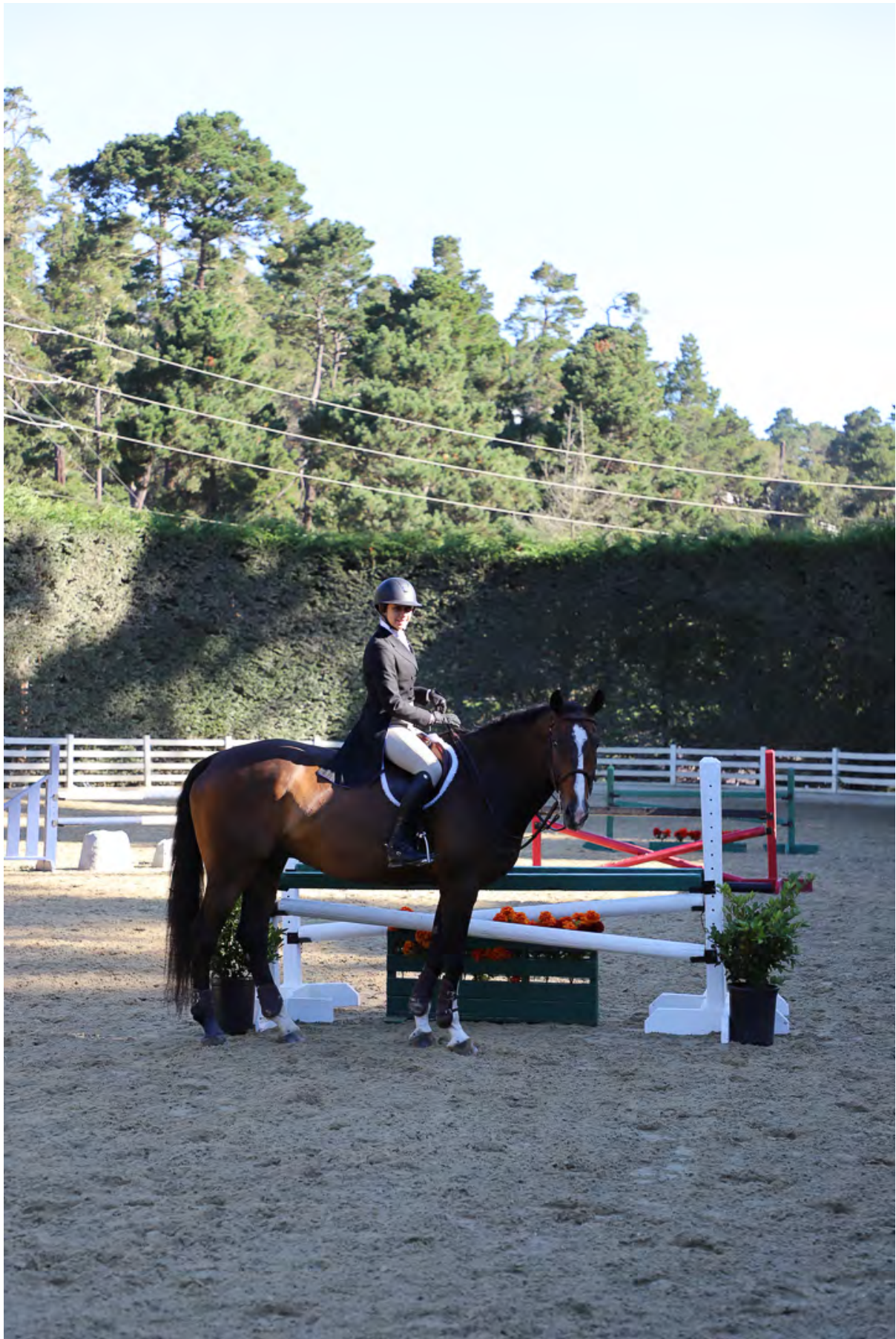
Guests also enjoyed a few of the horses which are stabled here who did jumping demonstrations.