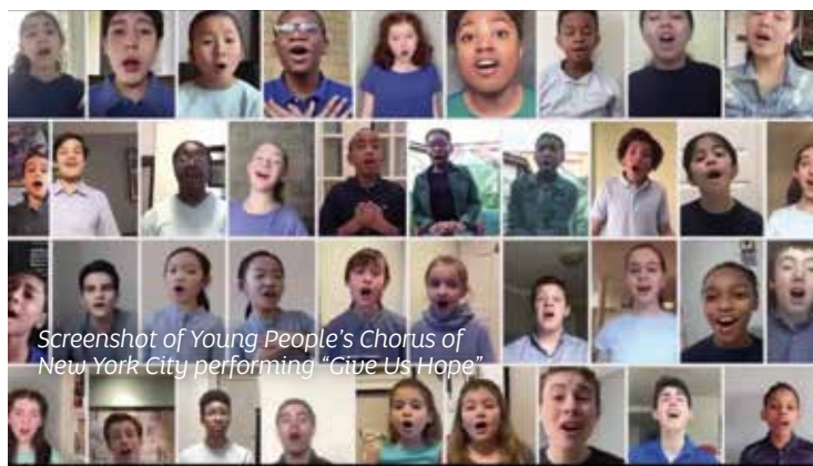
Screenshot of Young People's Chorus of New York City performing "Give Us Hope"