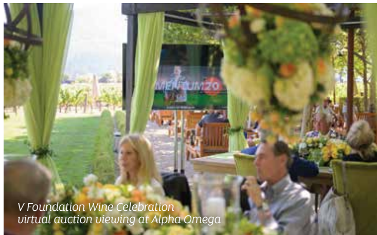
V Foundation Wine Celebration virtual auction viewing at Alpha Omega